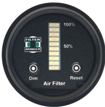
LED Round (2") Display for In-Dash Mounting Series 1957-3