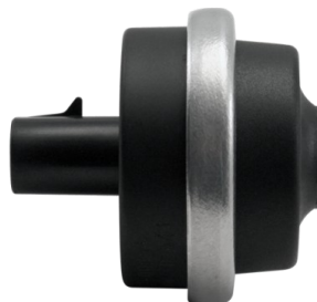
Non-Locking Air Switch Series 196389 Series 196351