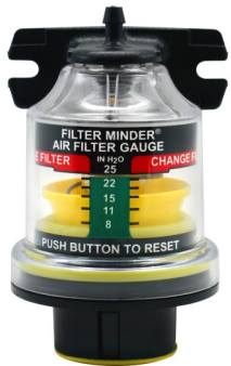
Remote Mount Series 136501R

As the filter restricts, the yellow position indicator fills the clear window until reaching the red zone. The position indicator locks at the highest restriction so that it can be read after engine shutdown.