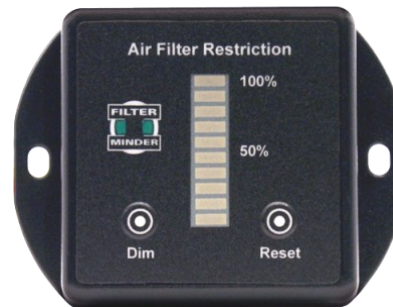
LED Square Display Series 1957-2