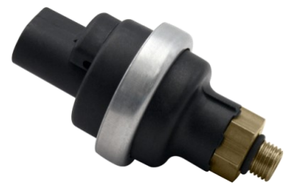
Non-Locking Switch Series 156389 Series 156351

Non-Locking Switches monitor the condition of engine air filters, fuel filters, brake systems and vacuum/pressure applications. The system levels are continuously monitored and switch activated once the predetermined set point is achieved.