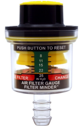
Grommet Mount Series 133501