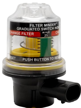
Graduated Visual and Switch Series 135578