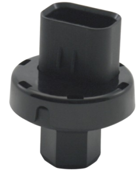
Continuous Output Low Pressure / Vacuum Sensor Series 115305