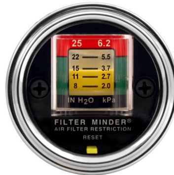
Dash Mount Series 168501