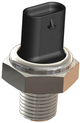
Continuous Output Heavy Duty Sensor Series 115206