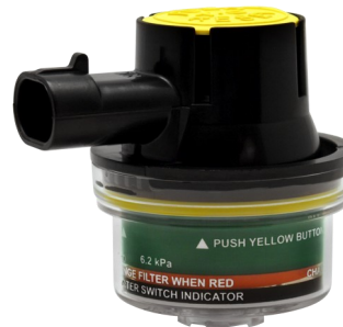
Single Position Visual and Switch Series 175578

The yellow visual position indicator fills the clear window as the filter restricts and triggers the switch when the red zone is reached. It locks on the warning light until the switch is reset.