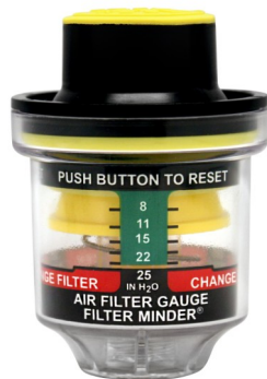
Threaded Mount Series 135501